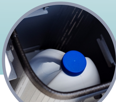
Easy refill storage