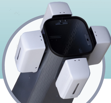
Holds up to 4 attachments