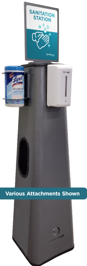
Various Attachments Shown